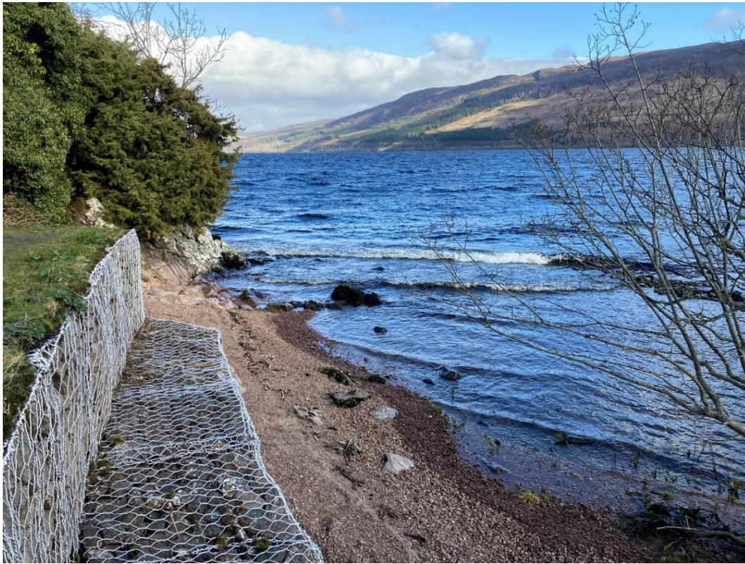
Photograph 29: Further view of the Gabion Baskets below the 'Water Gate' (facing north) demonstrating existing protection against erosion, as well as the rock outcrop on which most of the castle sits dropping into the loch.