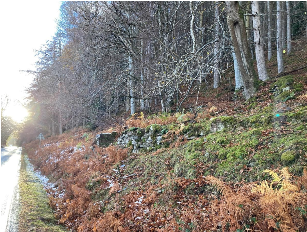
Photograph 23: Ruskich Wood Inn and farmstead (MHG63056) on the north side of the A82.