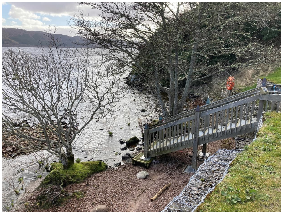
Photograph 27: View of the small former landing area on the eastern side of Urquhart Castle, below the 'Water Gate' showing a wide previously disturbed area now protected by Gabion Baskets.