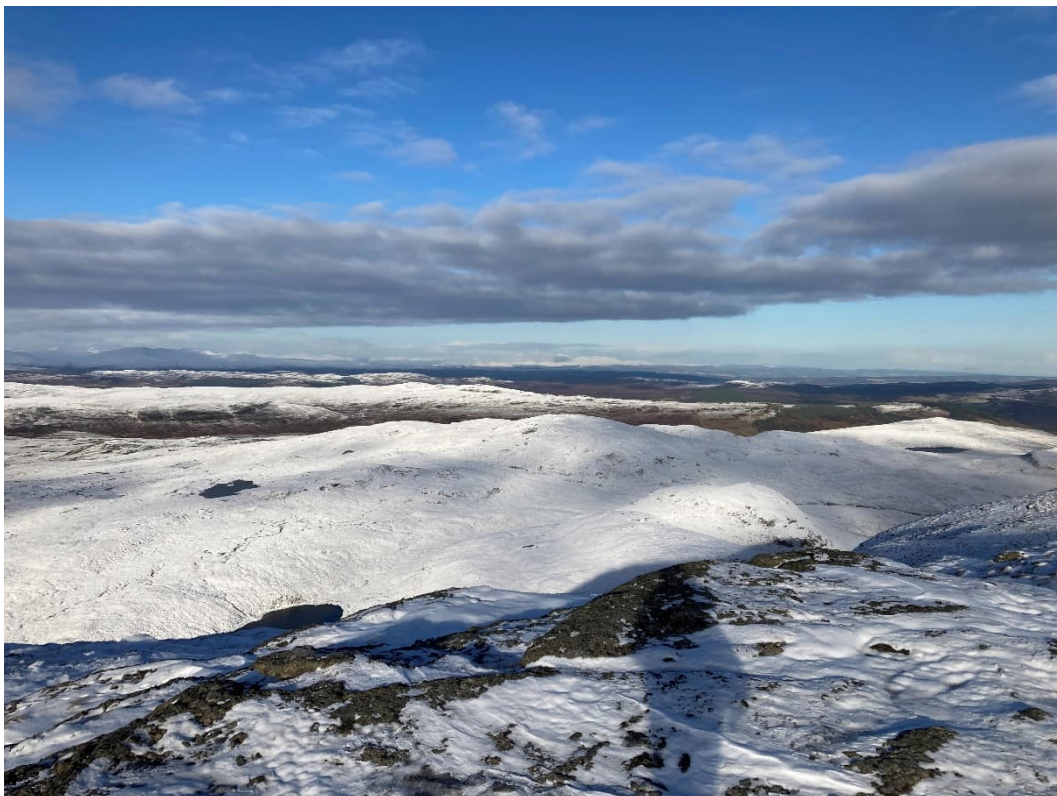
Photograph 2: View from the summit of Meall Fuar-mhonaidh looking to the northeast and the area of the eastern embankments and the access tracks.