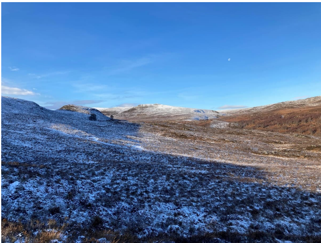
Photograph 14: View of the area of Temporary Compounds and Temporary Workers Accommodation.