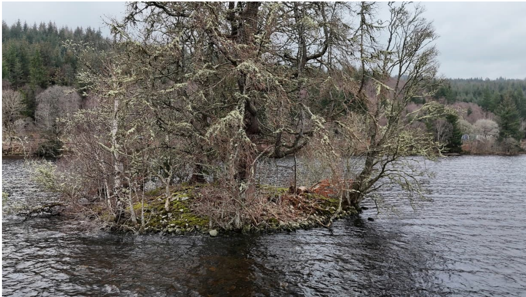
Photograph 17: View of Cherry Island Crannog (SM9762) from the southeast taken from a drone.