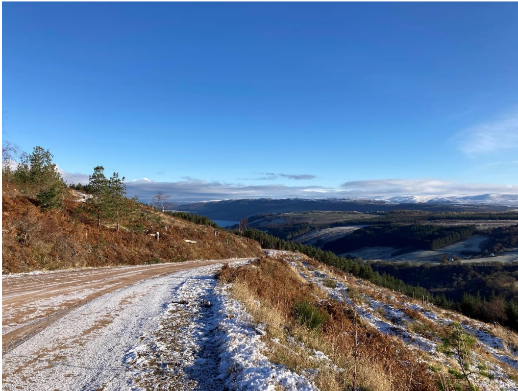
Photograph 9: View of forestry access track to be upgraded.