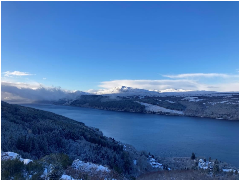
Photograph 20: View of the Proposed Development from Dun Deardail Forts (SM11884) over Loch Ness towards the Proposed Development. The Headpond is located beyond the high-ground of Meall Fuar-mhonaidh