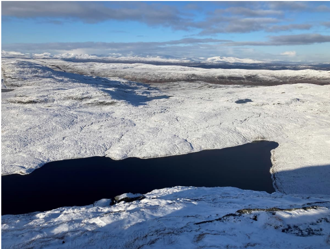
Photograph 5: View north from Meall Fuar-mhonaidh towards Saddle Dam 1.