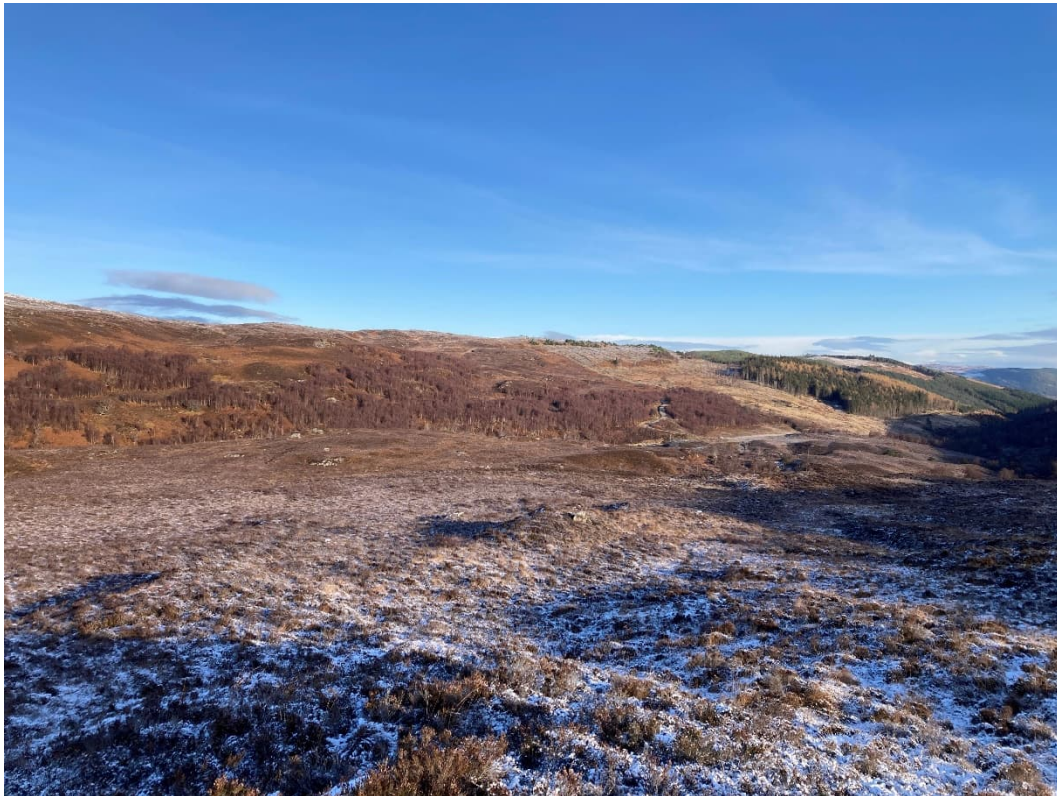
Photograph 13: View of the area of Temporary Compounds and Temporary Workers Accommodation.