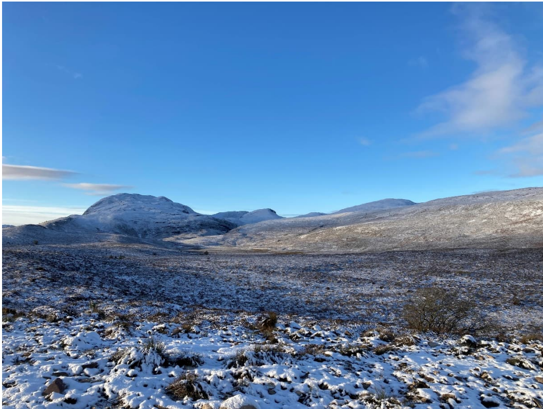
Photograph 1: View of the Proposed Development from the northeast with the high ground of Meall Fuar-mhonaidh left of centre.