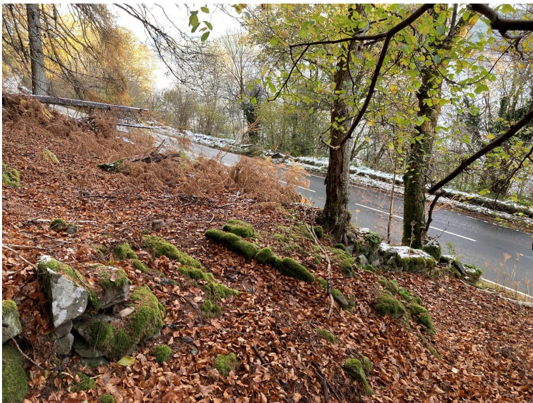
Photograph 24: Ruskich Wood Inn and farmstead (MHG63056) on the north side of the A82.