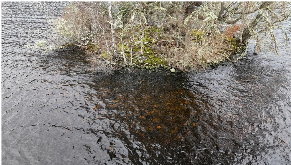
Photograph 19: View of Cherry Island Crannog (SM9762) from a drone showing the shoreline, as well as the moss covered stone/rubble that appears to form the island.