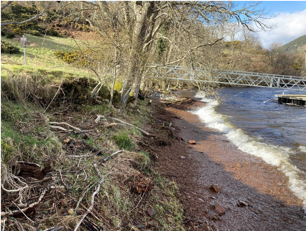
Photograph 25: View of the shoreline on the north side of Urquhart Castle (SM90309) showing the current extent of erosion/disturbance.