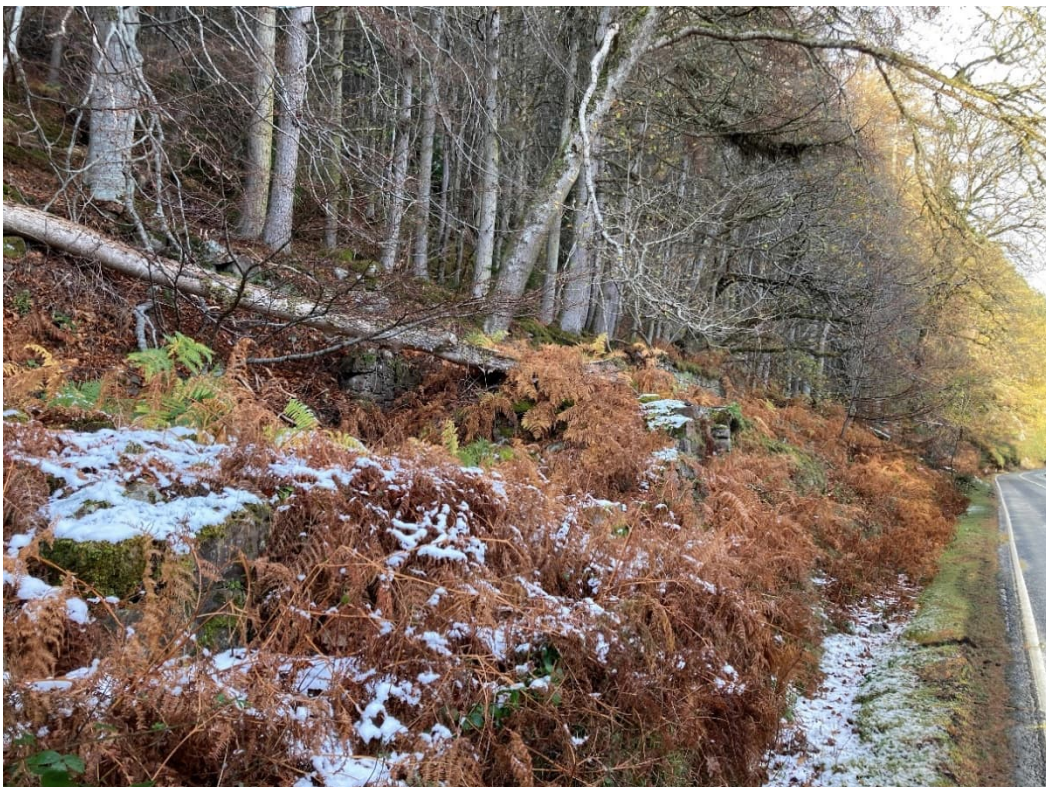
Photograph 22: Ruskich Wood Inn and farmstead (MHG63056) on the north side of the A82.