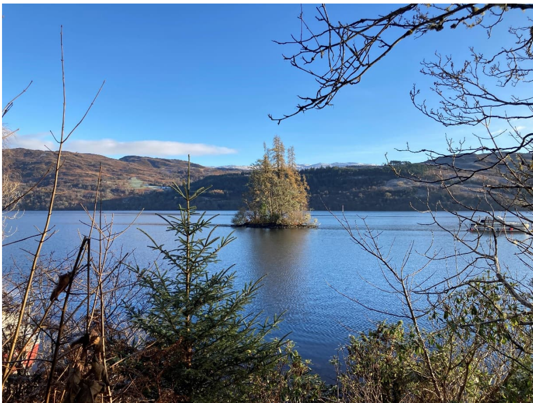
Photograph 16: View of Cherry Island Crannog (SM9762) from the northern shore of Loch Ness.