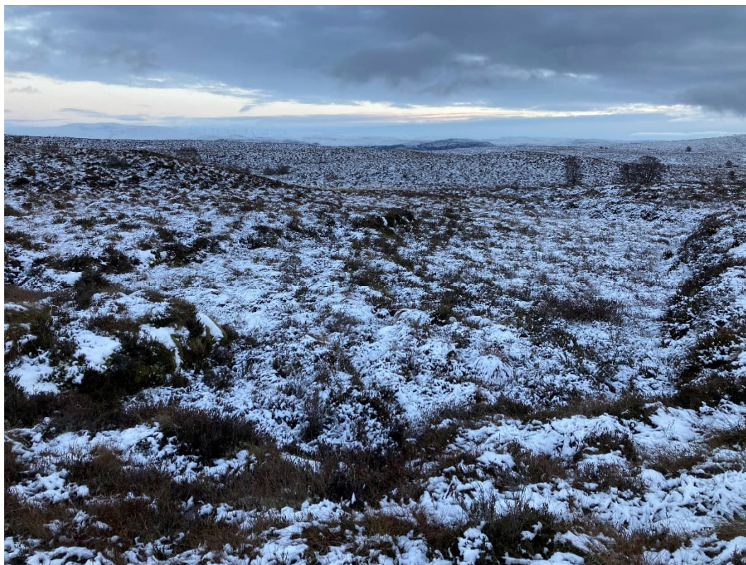
Photograph 7: View of former peat cutting area (AECOM 010).