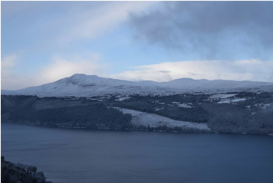
Photograph 21: View of the Proposed Development from Dun Deardail Forts (SM11884) over Loch Ness. Dun Scriben Fort (SM6220) is located centre of image in the woodland above the clearing.