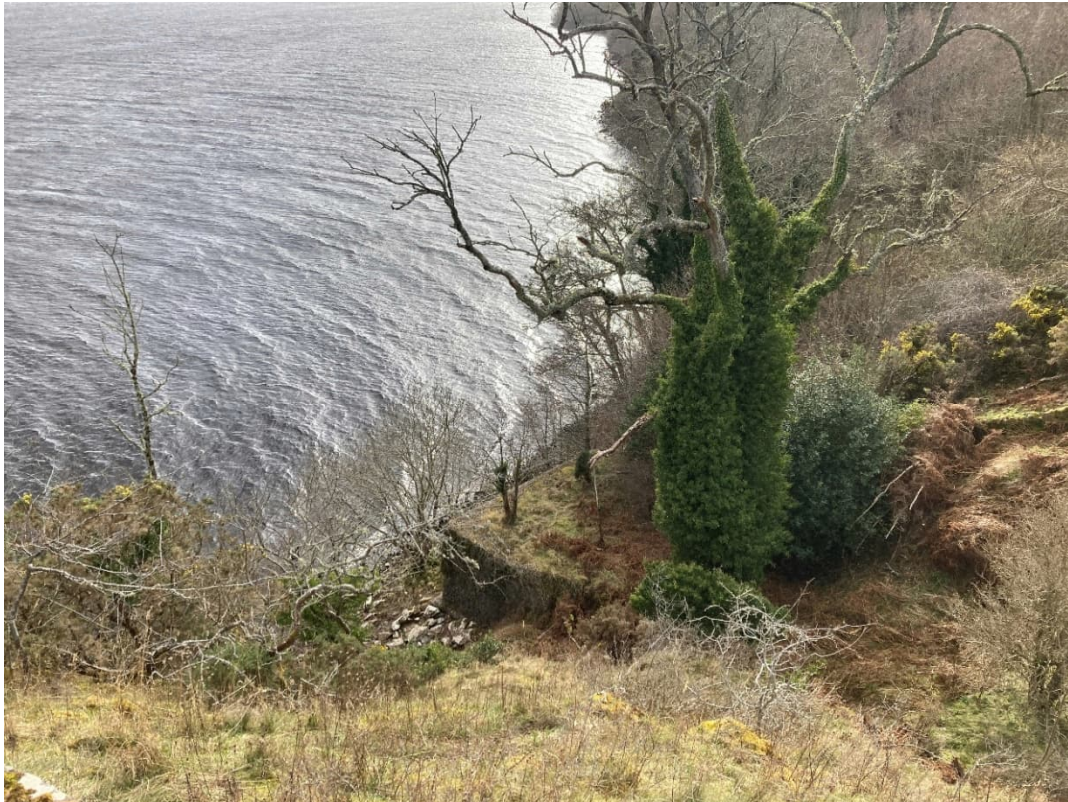
Photograph 30: View of the southern end of the 'moat' at Urquhart Castle with stone structure and Gabion Basket protection.