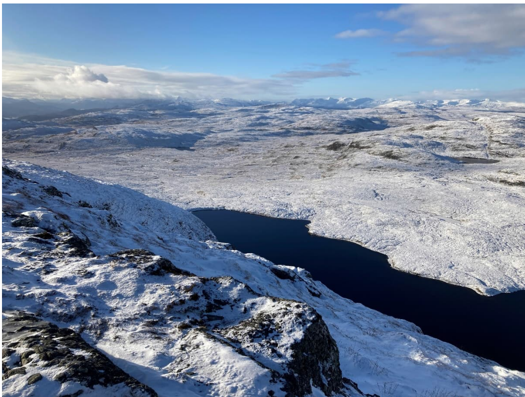
Photograph 4: View of the southwestern end of Loch nam Breac Dearga and the area of the Main Dam.