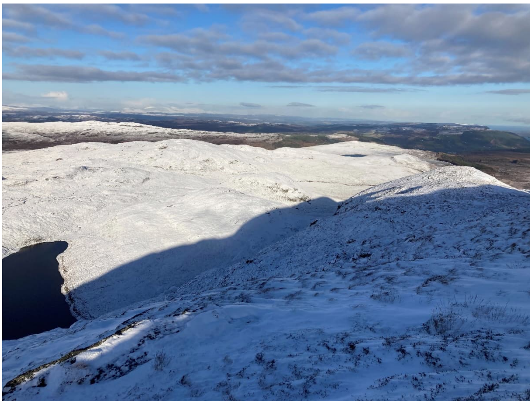
Photograph 6: View from Meall Fuar-mhonaidh towards Saddle Dam 2 and the Spillway.