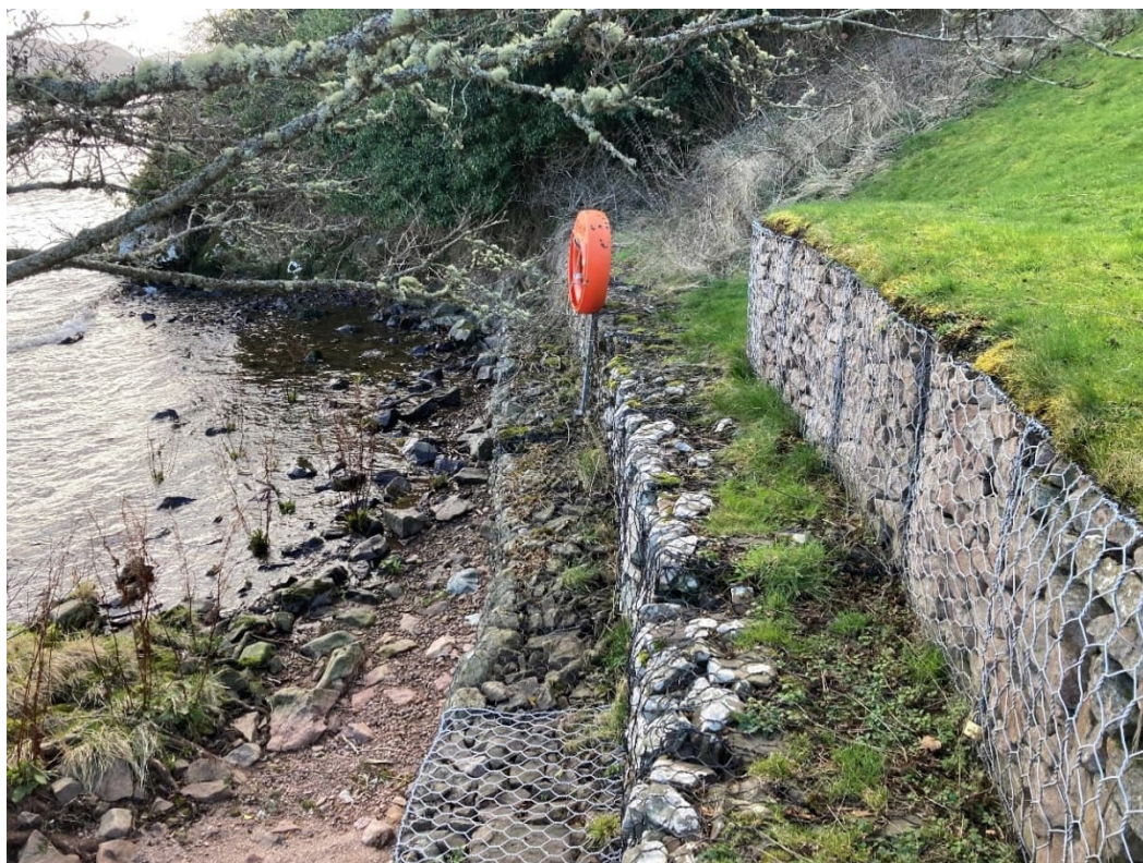
Photograph 28: Further view of the Gabion Baskets below the 'Water Gate' (facing south) demonstrating existing protection against erosion.