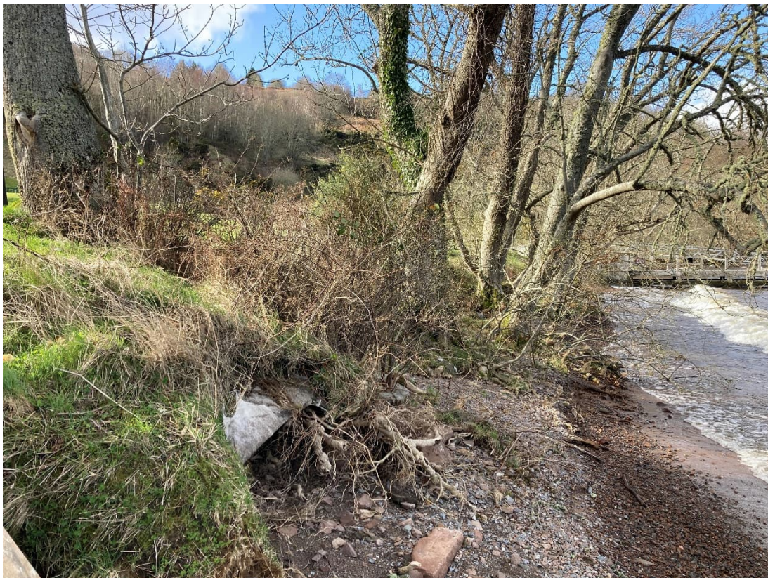
Photograph 26: Further evidence of previous disturbance, with geotextile visible in the section/shoreline.