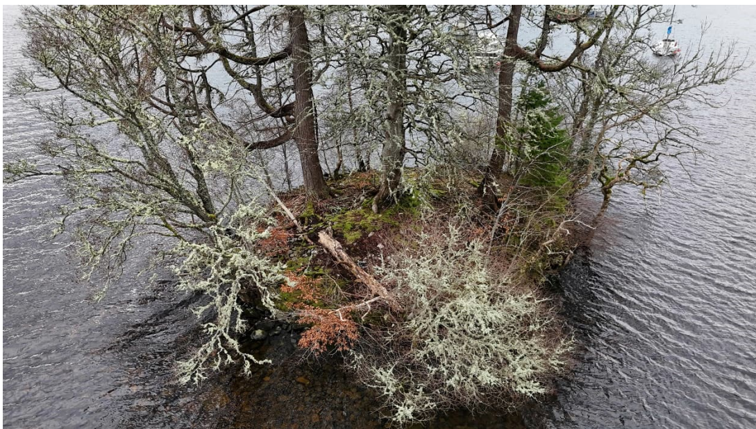
Photograph 18: View of Cherry Island Crannog (SM9762) from a drone showing extensive tree cover.