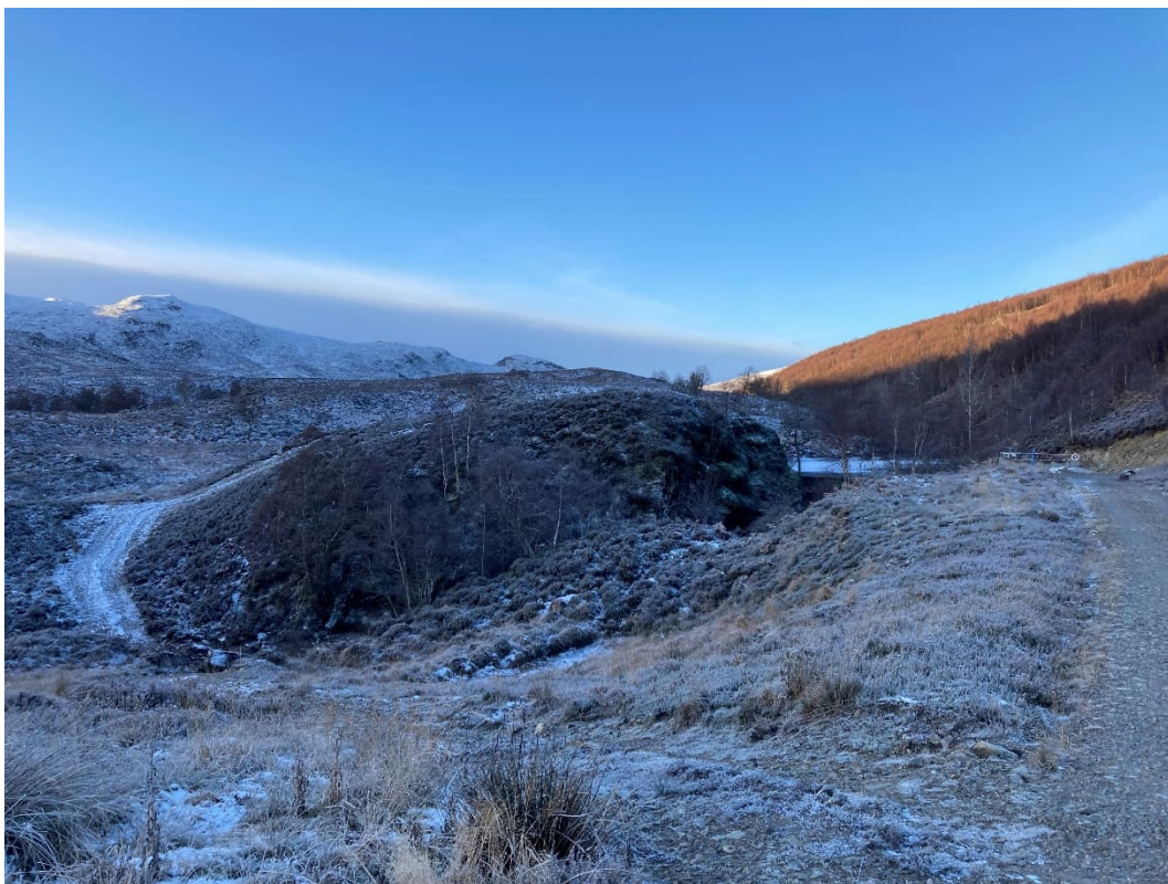
Photograph 12: View of the existing hydro scheme on the River Coiltie with the area of the Workers Accommodation and Temporary Compounds in the distance.