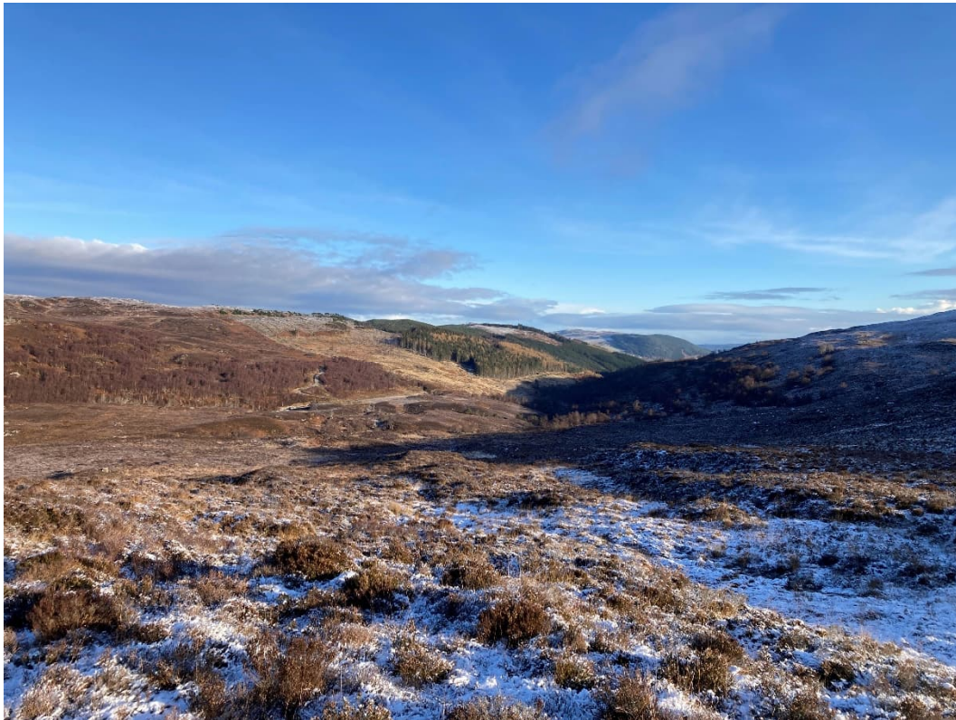
Photograph 15: View of the area of Temporary Compounds and Temporary Workers Accommodation.