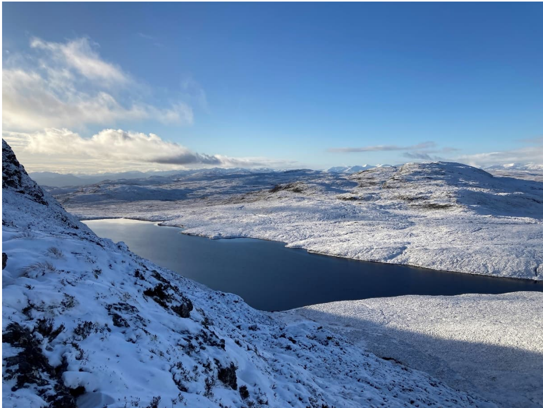
Photograph 3: Loch nam Breac Dearga and the Headpond from the northeast.