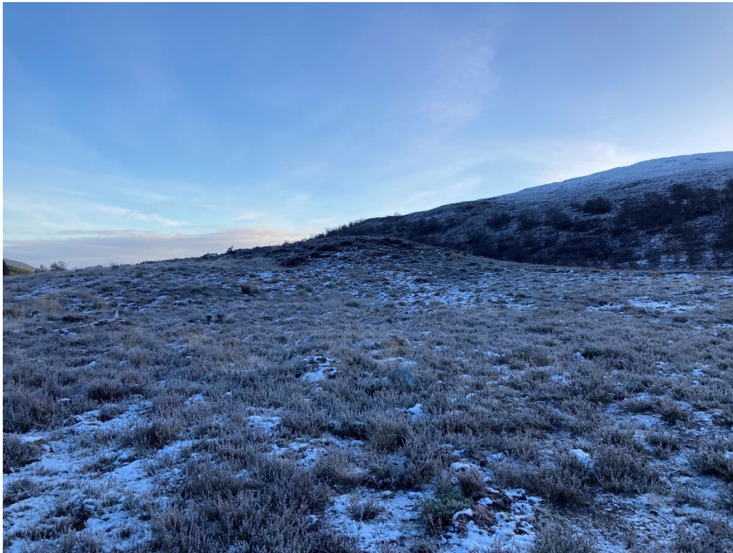
Photograph 11: View of previously disturbed ground near the existing hydro scheme on the River Coiltie.