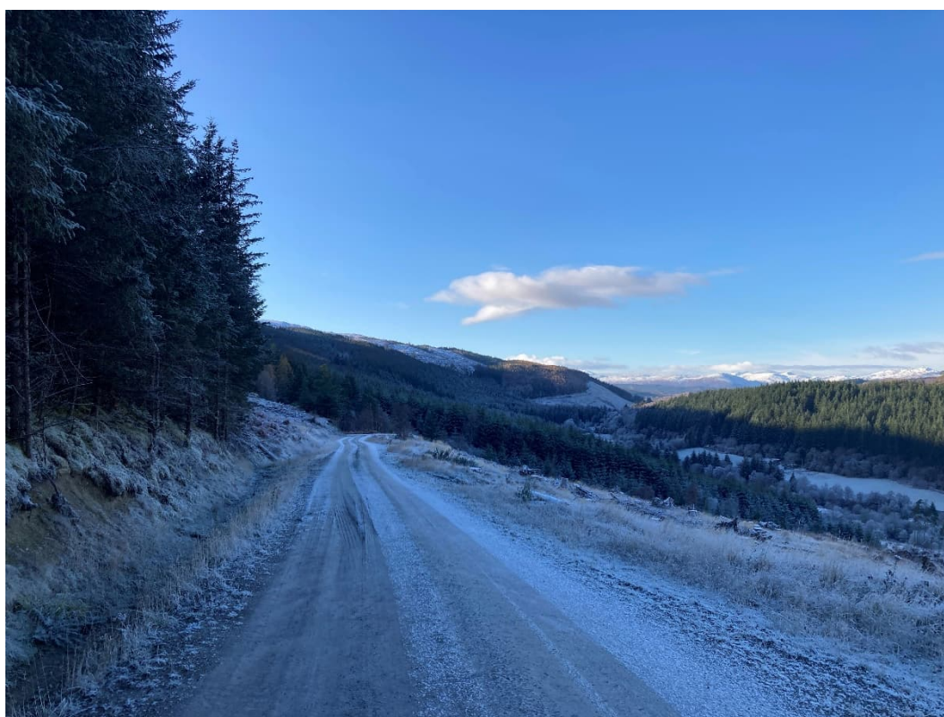
Photograph 8: View of forestry access track to be upgraded.